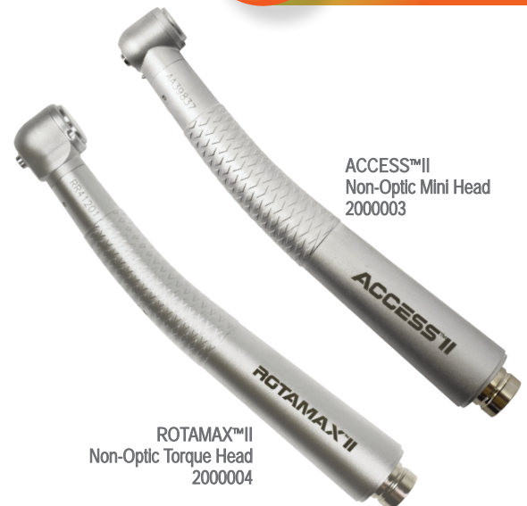
ACCESS™II Non-Optic Mini Head 2000003

Non-Fiber Optic High Speed Handpieces Net 4+1 $363.73 ea. Plus 2 Free Couplers!