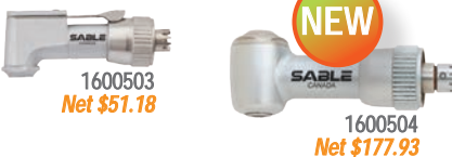
1600503 Net $51.18