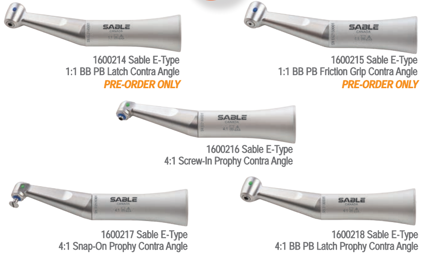
1600214 Sable E-Type 1:1 BB PB Latch Contra Angle PRE-ORDER ONLY

Buy 3 Get 1 Free + Free Lube! Or Buy 11 Get 4 Free! Mix Match allowed. Net 3+1 $243.04 ea.