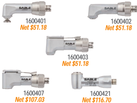
1600401 Net $51.18