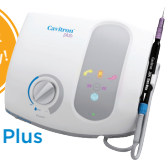
Cavitron® Plus #8161425