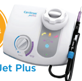
Cavitron® Jet Plus #8161428