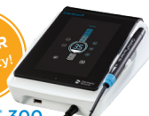
Cavitron® 300 #8161429

Cannot be combined with any other offer.