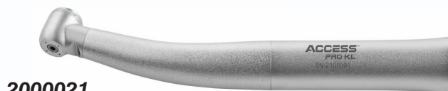
2000021 Access™ Pro KL - Mini Head • Kavo Type Back End