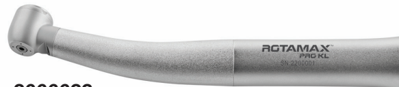
2000022 Rotamax™ Pro KL - Torque Head • Kavo Type Back End