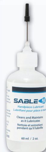
2200105 EZ Lube Dropper Bottle 60ml • 2oz

* Free component must be of equal or lesser value than least expensive component purchased. The following are registered trademarks of the indicated companies: Kavo - Kaltenbach & Voigt GmbH & Co. NSK - NSK Nakanishi Inc, Star - Dental EZ Group, DENTSPLY International Inc (Midwest, Cavitron, RDH, Bobcat, SPS), Midmark, SciCan Statim. Sable Industries Inc. is in no way affiliated with the above companies. Q1 Specials effective from January 1st to March 31st, 2024.