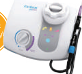
Cavitron® Jet Plus #8161428