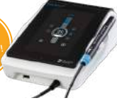
Cavitron® 300 #8161429