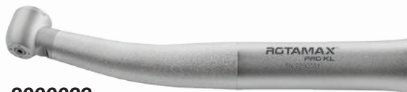
2000022 Rotamax™ Pro KL - Torque Head • Kavo Type Back End