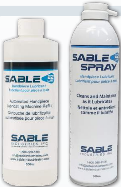
2200103 EZ Lube Spray 500ml