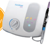
Cavitron® Plus #8161425