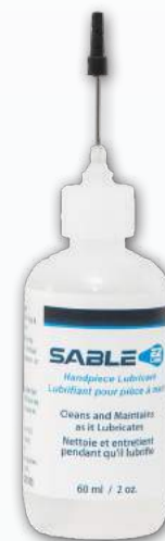
2200105 EZ Lube Dropper Bottle 60ml • 2oz